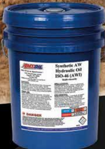
SYNTHETIC HYDRAULIC FLUIDS