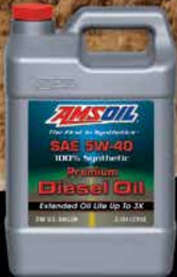
SYNTHETIC DIESEL OILS